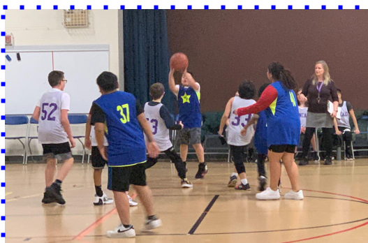
WP Basketball team plays Kincaid school